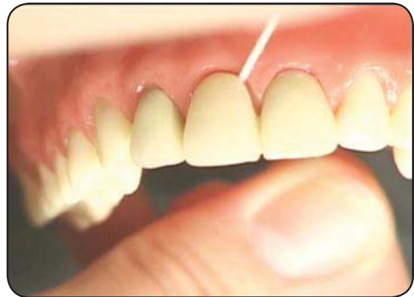
Superflossing a bridge