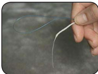
Superfloss showing stiff and fuzzy, tufted segments

Brush and floss your teeth and gums normally after each meal to keep your mouth healthy. Make sure to brush and floss the abutment teeth carefully to keep them strong and healthy.